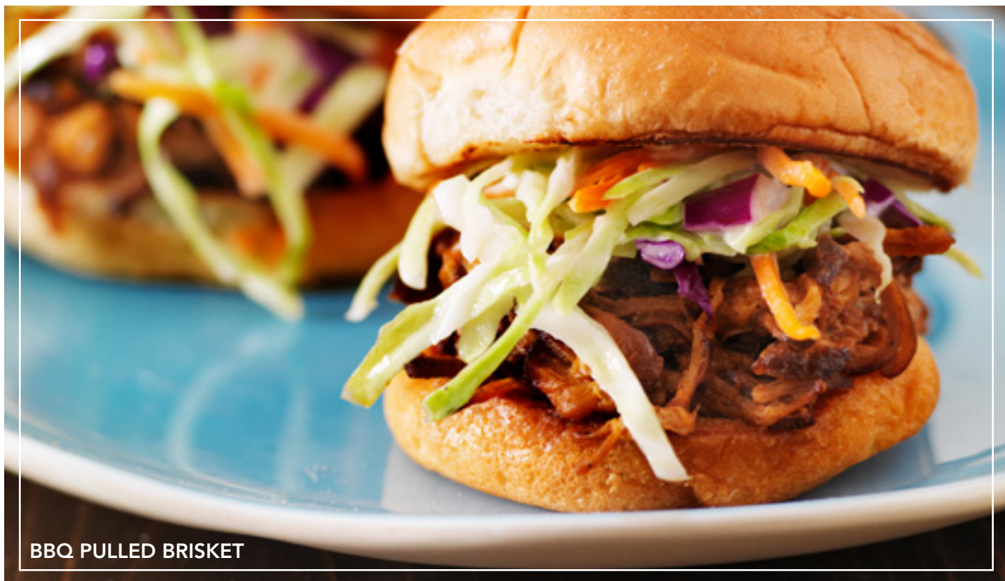
BBQ PULLED BRISKET

Riviera Gourmet Salad Greens (V): Sweet Basil Vinaigrette Chicken Breast Provençal: Tomatoes/Olives Rosemary Pork Loin: Dijon Pan Sauce Pasta Salad (V): Shell Pasta/Tomatoes/Artichokes Balsamic & Cracked Pepper New Potatoes (V) Sautéed Green Beans with Thyme (V) Fresh Fruit Salad (V) with French Baguette/Sweet Butter (V)