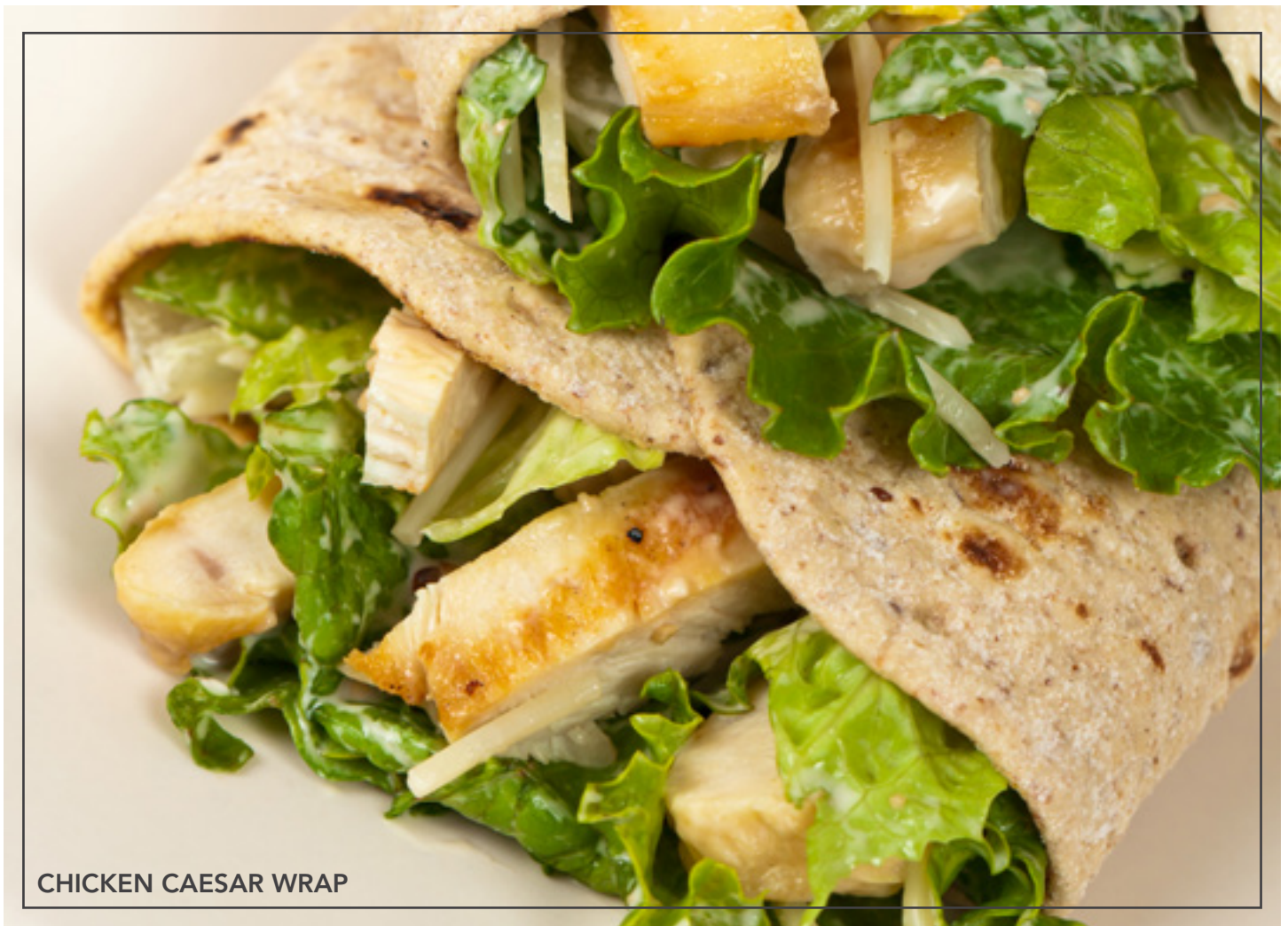
CHICKEN CAESAR WRAP