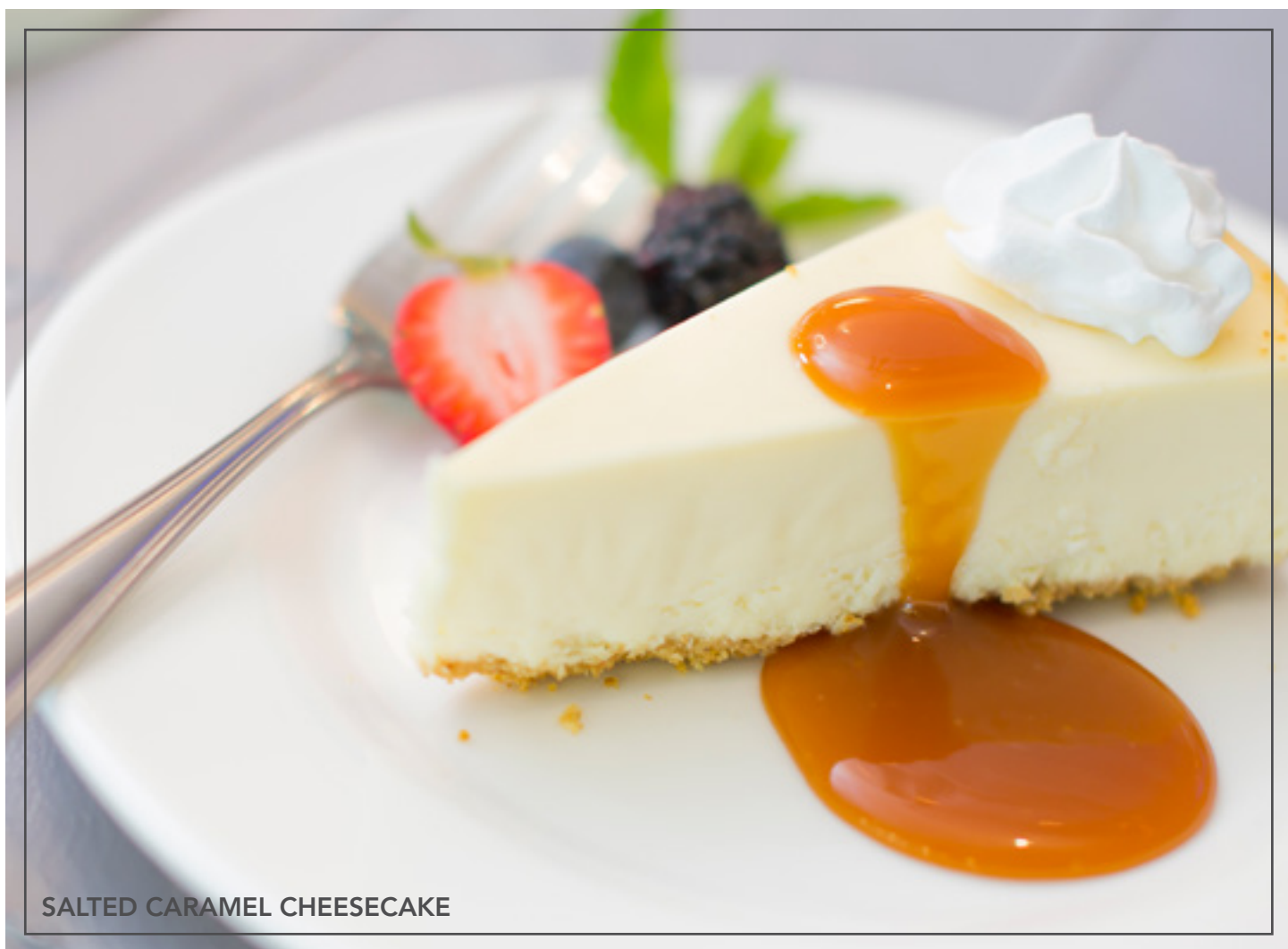
SALTED CARAMEL CHEESECAKE